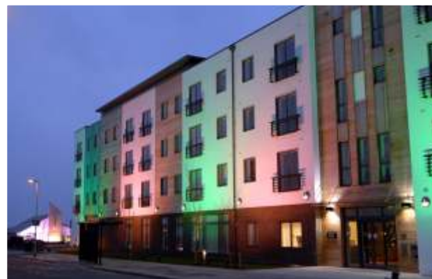
The demolition of the Royal Marine Pub, St.Paul's Church and the old Efford Library has created physical change over the last two years. A new striking extra care scheme providing 40 self-contained flats for the elderly, a new library and a new, modern St.Pauls Church and Community Hall have transformed the landscape and laid foundations for a new beginning.