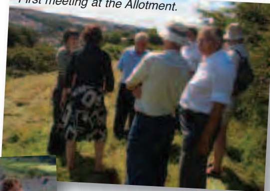
First meeting at the Allotment.