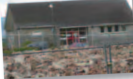
The old Efford Library.

The HECP have joined forces with all the agencies involved with the new facilities and will invite residents to join them in celebrating Torrige Way in December. The new Extra Care Scheme, St Paul's Church and Library all hope to be opening in Late November 07 – Early December 07 so a celebration to mark this event will be organised. Dates have yet to be confirmed but please watch out for publicity.